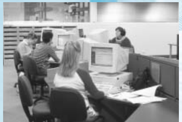
Views of the David Mann Library