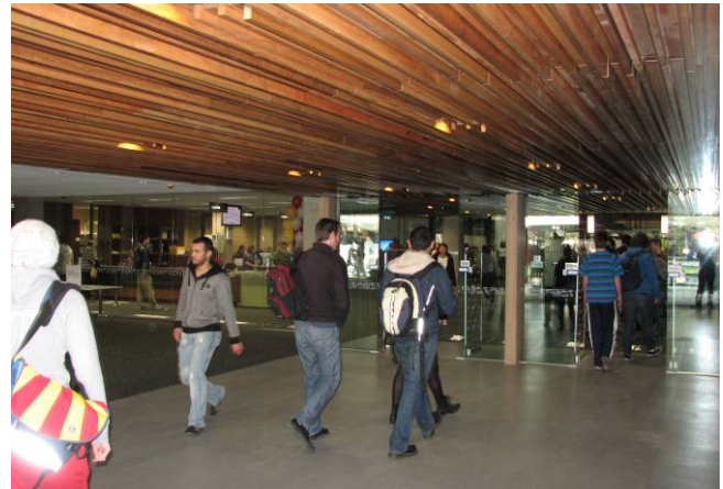
Above: New foyer and security gates.