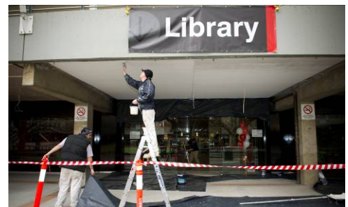
Above: There was a last minute rush to finish the work!