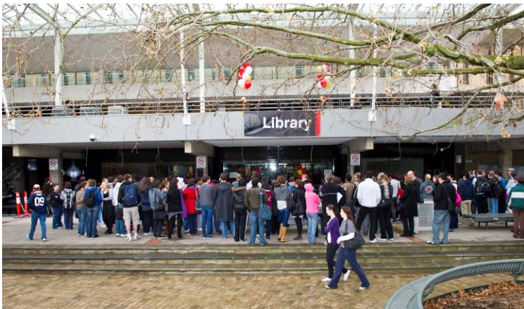
Left: Students and staff gather at the Library entrance before the new doors are opened.