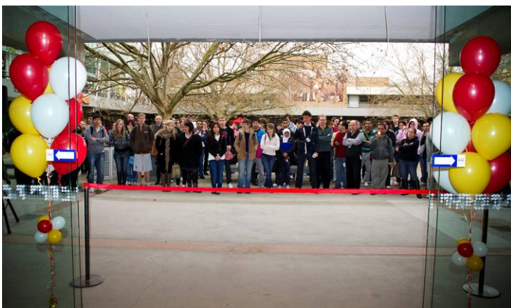
Left: The crowd awaits the cutting of the red ribbon.