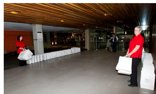
Above: Staff wait inside with the 100 goodie bags.