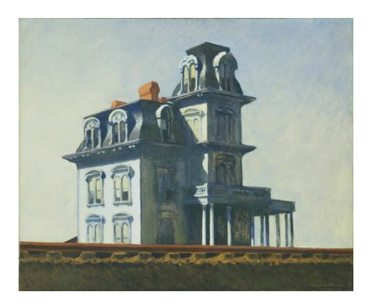
Figure 3. House by the Railroad, 1925, by Edward Hopper.

Likewise, Eve Bunting's 1990 picture book In the Haunted House , aesthetically demonstrates the same prototype. The architectural details in this tale, drawn by Susan Meddaugh, appear to use the same Hopper painting for inspiration; the story's haunted house features white-clapboard siding, arched windows, a turret, and a bell-cast mansard roof (see figure 5). Readers are told "this is the house where the scary ones hide" and we are encouraged to "open the door and step softly inside" (1). Provoking readers to enter an evidently threatening dwelling is a typical plot device in such books and upon doing so we are provided with a tour of the home's various interior spaces. Inside this decidedly elaborate space, with its "cracked chandeliers" and "dark, paneled walls," (5) we encounter an array of ghosts and witches. The book concludes with an image of people lined up outside the home near a sign that states "Halloween House," thus revealing the house is really a carnival fun-house. Again we find the juxtaposition of presenting a haunted house in an initially foreboding and subsequently cheerful manner. The architectural structures that serve as the stage settings within these books denote a particular archetype and the potential reasons for this suggests much about why adults perpetuate haunted house-themed stories for children.