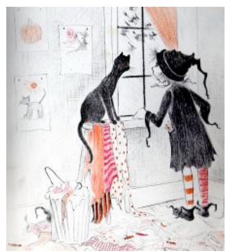
Figures 6 and 7. Images taken from: Combs, Patricia. Dorrie and the Haunted House . (New York, Lothrop, Lee and Shepard Co., 1970).

Seeking shelter, Dorrie heads to the nearby woods where she discovers "a big gray house looming between the trees" (13). Rather than appearing apprehensive Dorrie scurries "up the broken steps to the old porch" where "broken shutters banged in the wind" and "vines and branches skreeked" against the clapboards (14). Without hesitation, Dorrie enters the house and eagerly tours its grandiose rooms. She soon discovers she is not alone, for the house is also sheltering two criminals, whose presence prompts Dorrie to scramble from one space in the house to another, trying to escape the men's voices which start "yelling louder and louder " and sound "madder and madder " (27). After falling into a bale of flour, Dorrie becomes aware that the Big Witch and her counterparts have come to find her: upon seeing Dorrie's ghostly-white appearance her potential saviours turn and flee. Terrified at the prospect of being alone in the house with two malevolent criminals, Dorrie flees for home. The most disturbing threats she encounters in the "haunted house" are therefore not ghost-related. Rather, the verbal aggression – and potential physical hostility - of the two male criminals, as well as the abandonment by her network of family and friends are the warranted concerns in this tale.