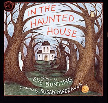
Figures 4 and 5. Left: cover illustration from The House That Drac Built by Judy Sierra, illustrated by Will Hillenbrand. Illustration copyright © 1995 by Will Hillenbrand. Reprinted by permission of Houghton Mifflin Harcourt Publishing Company. All rights reserved. Right: cover illustration from In the Haunted House