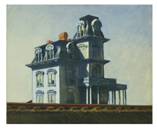
Figure 3. House by the Railroad, 1925, by Edward Hopper.

Likewise, Eve Bunting's 1990 picture book In the Haunted House , aesthetically demonstrates the same prototype. The architectural details in this tale, drawn by Susan Meddaugh, appear to use the same Hopper painting for inspiration; the story's haunted house features white-clapboard siding, arched windows, a turret, and a bell-cast mansard roof (see figure 5). Readers are told "this is the house where the scary ones hide" and we are encouraged to "open the door and step softly inside" (1). Provoking readers to enter an evidently threatening dwelling is a typical plot device in such books and upon doing so we are provided with a tour of the home's various interior spaces. Inside this decidedly elaborate space, with its "cracked chandeliers" and "dark, paneled walls," (5) we encounter an array of ghosts and witches. The book concludes with an image of people lined up outside the home near a sign that states "Halloween House," thus revealing the house is really a carnival fun-house. Again we find the juxtaposition of presenting a haunted house in an initially foreboding and subsequently cheerful manner. The architectural structures that serve as the stage settings within these books denote a particular archetype and the potential reasons for this suggests much about why adults perpetuate haunted house-themed stories for children.