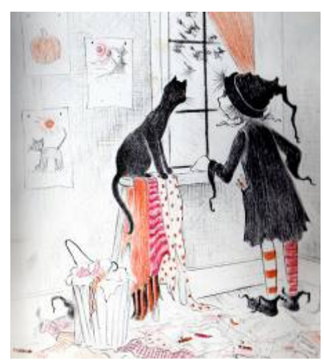
Figures 6 and 7. Images taken from: Combs, Patricia. Dorrie and the Haunted House . (New York, Lothrop, Lee and Shepard Co., 1970).

Seeking shelter, Dorrie heads to the nearby woods where she discovers "a big gray house looming between the trees" (13). Rather than appearing apprehensive Dorrie scurries "up the broken steps to the old porch" where "broken shutters banged in the wind" and "vines and branches skreeked" against the clapboards (14). Without hesitation, Dorrie enters the house and eagerly tours its grandiose rooms. She soon discovers she is not alone, for the house is also sheltering two criminals, whose presence prompts Dorrie to scramble from one space in the house to another, trying to escape the men's voices which start "yelling louder and louder " and sound "madder and madder " (27). After falling into a bale of flour, Dorrie becomes aware that the Big Witch and her counterparts have come to find her: upon seeing Dorrie's ghostly-white appearance her potential saviours turn and flee. Terrified at the prospect of being alone in the house with two malevolent criminals, Dorrie flees for home. The most disturbing threats she encounters in the "haunted house" are therefore not ghost-related. Rather, the verbal aggression – and potential physical hostility - of the two male criminals, as well as the abandonment by her network of family and friends are the warranted concerns in this tale.